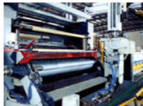
Robotic winding system