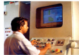
Computer control inspection

THONG GUAN PLASTIC & PAPER INDUSTRIES SDN.BHD. 73976-V