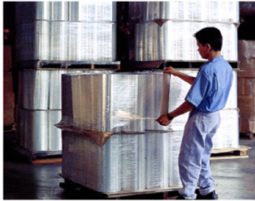
Hand wrap process