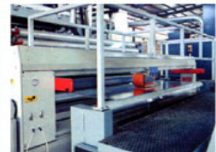
Radioactive thickness- controlled process