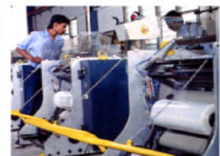
Rewinding stretch wrap into smaller rolls

LOT, 52, JALAN PKNK 1/6, KAWASAN PERUSAHAAN SUNGAI PETANI, 08000 SUNGAI PETANI, KEDAH, MALAYSIA. TEL: 604-441 7888 (6 LINES) FAX:604-441 9888