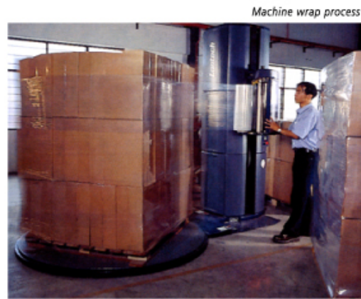
Machine wrap process